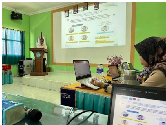
Figure 5. Welcoming and Motivation at the training event