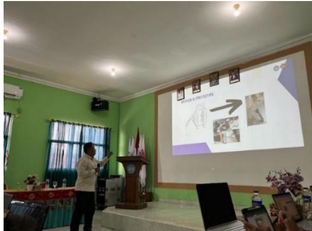
Figure 6. Presenting Material by Prof. Dr. Abdurrahman, M.Si about STEM ESD-for SDGs.

discussions, and exercises or practices. During the training, the participants were very enthusiastic. This is evident from the many questions asked by workshop participants. All presentation of the material is given practice or design or implementation of what practices are possible in on-service training.