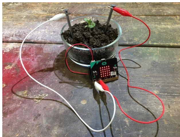
Figure 2. Soil drought sensor demonstration tool as one of the natural disasters due to climate change and global warming

Simple teaching aids developed can be used to help students deepen their understanding of climate change and global warming, especially about reducing the impact of natural disasters that occur.